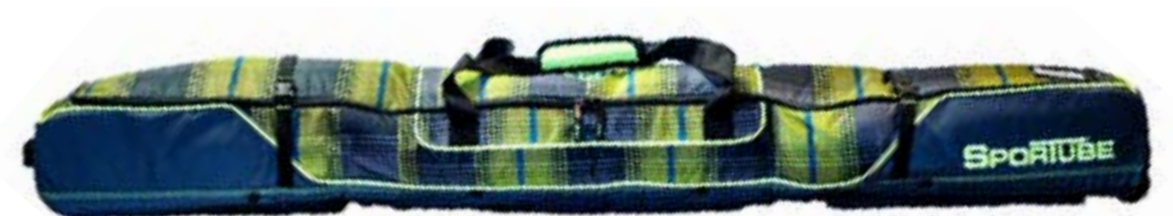
Ski Shield™ Ski/Snowboard Bag