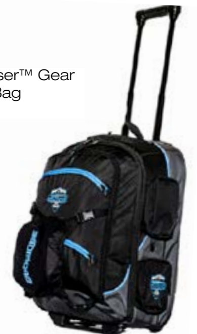
Cabin Cruiser™ Gear and Boot Bag