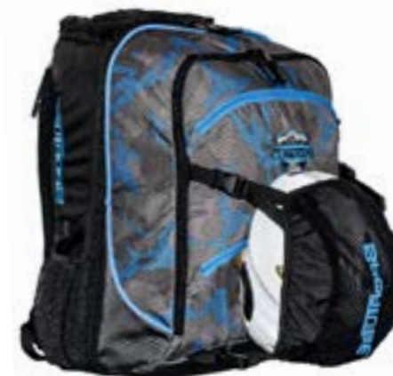
Overheader™ Gear and Boot Bag